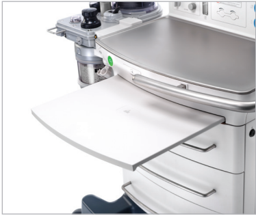
Pull-out work table