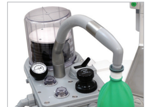
Flexible bag arm

Mindray North America 800 MacArthur Blvd., Mahwah, NJ 07430 Tel: 800.288.2121 Tel: 201.995.8000 Fax: 800.926.4275 www.mindray.com