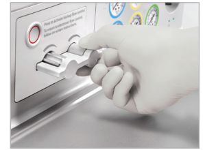
Backup gas (O 2 and Air)