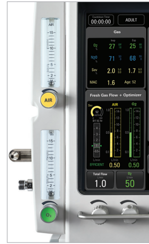
Auxiliary O 2 /Air