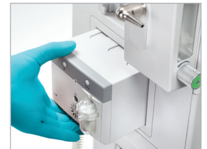
Integrated gas analysis