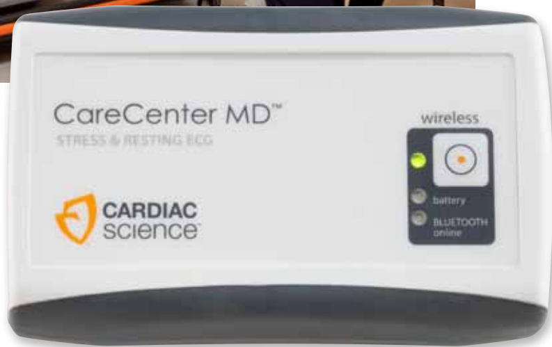
Actual size: Bluetooth wireless ECG and Stress data acquisition device.

Optional Bluetooth® wireless data acquisition eliminates clumsy wires, and allows patients and equipment to be placed where you want – enhancing safety and comfort. Plus, multiple Bluetooth acquisition devices can be paired with a single PC, and multiple PCs can pair with a single device. So you can create a solution with the exact equipment you need, exactly where you need it.