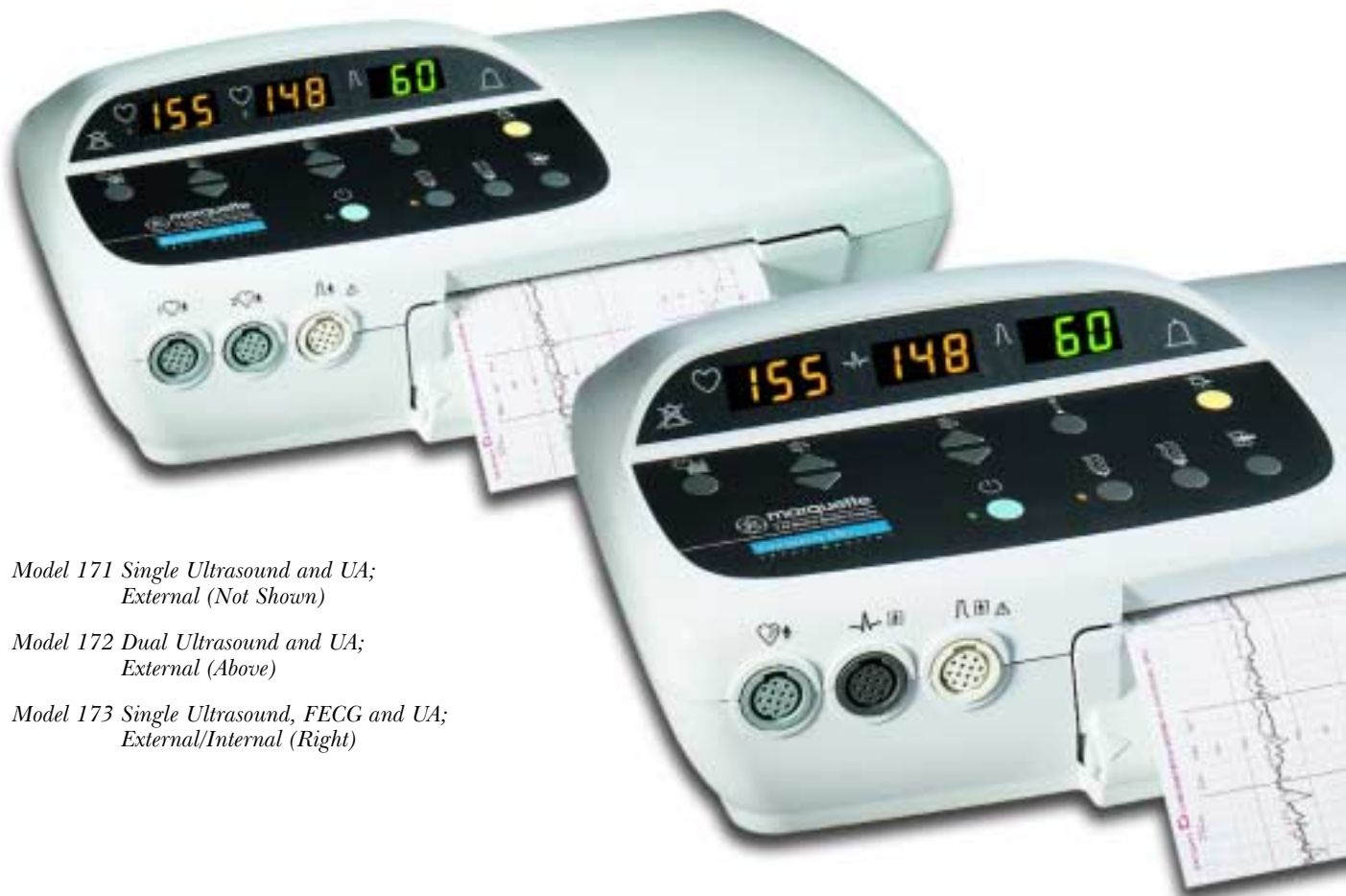
Model 171 Single Ultrasound and UA; External (Not Shown)