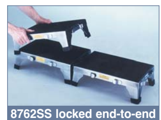
8762SS locked end-to-end

Add the optional dolly 8762SS-D for easy transportability.