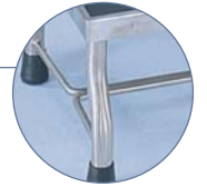
H-Brace offers extra reinforcement.